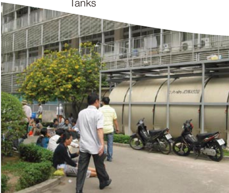
Wastewater Treatment Tanks