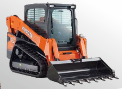
Compact Truck Loader