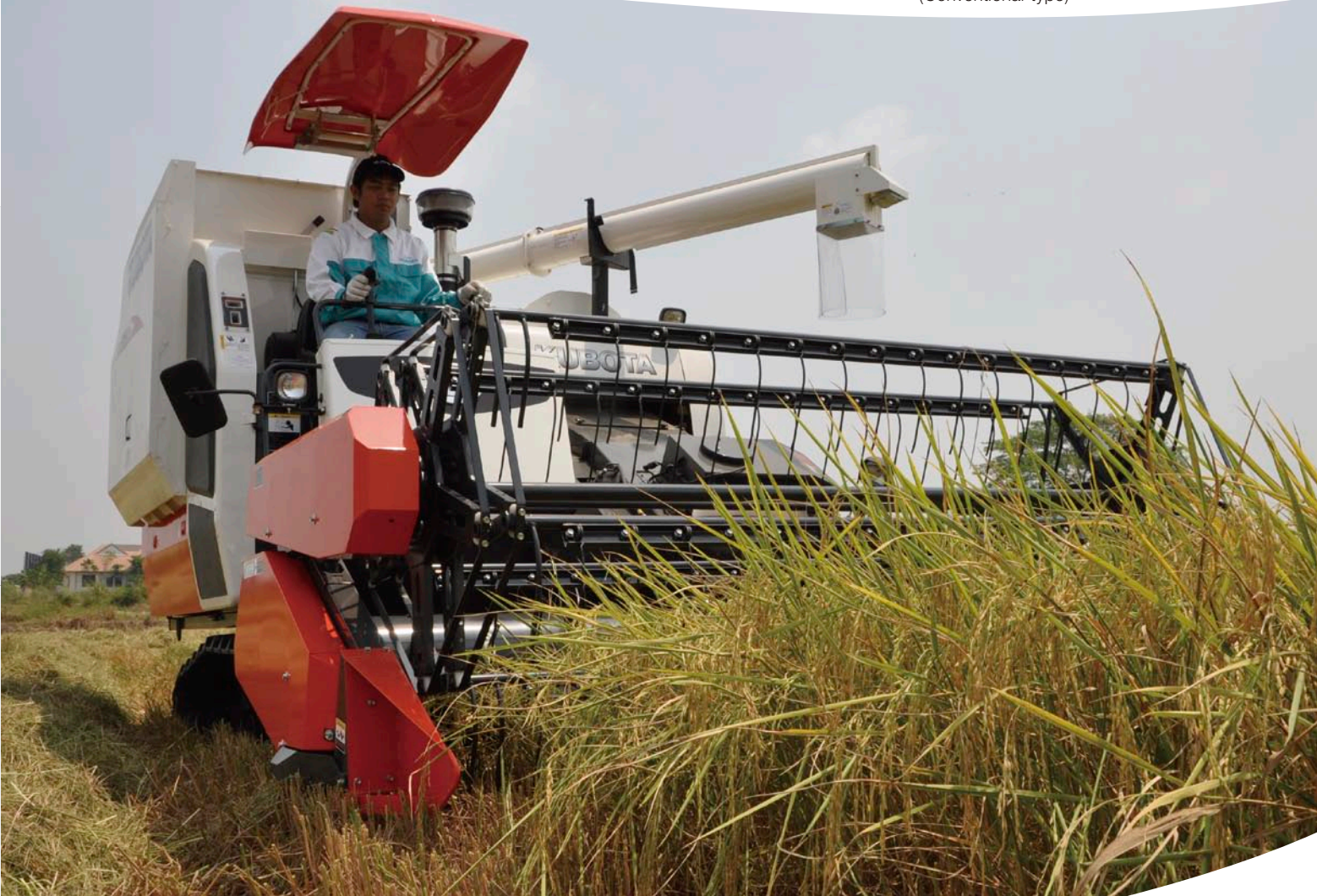
Combine Harvester (Conventional-type)

leasing agricultural machinery. The application for this subsidy started in July 2009 and the payment ended on March 31, 2010. At the same time, market condition of construction machinery remained severe with a lack of recovery of investment in construction. In this circumstance, the Company actively introduced new products and implemented promotional sales activities, and sales of tractors and farm machinery increased. However, sales of engine and construction machinery decreased substantially.