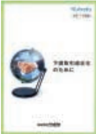
The Subcontracting Law Manual