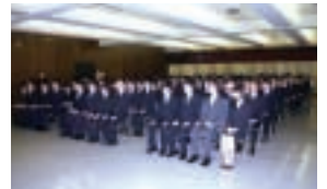
*2 Fiscal 2005 new employee initiation ceremony

*1 The Synthetic Pipe Division was abolished and its functions transferred to Kubota-C.I. Co., Ltd.