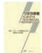
*6 "Products and technology that support global business" is the feature of this issue

*5 Continuous operation in the processing of remaining tobacco roots is possible without getting off the tractor