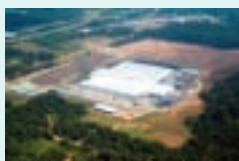
*18 View of the plant

Japan's largest "submerged ceramic membrane filtration tank facilities" completed for the Arita-cho area in Saga Prefecture