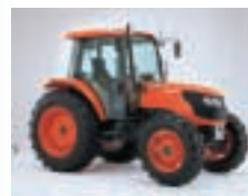
*14 Refined design suitable for a complete restyling of the M9540 model added and basic performance improvement implemented