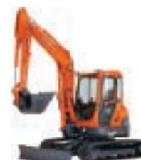
*15 Three models of compact rear turning radius mini-excavators put on the market