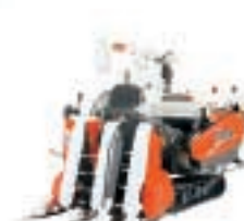
*16 Model No. 9 completely changed all at once