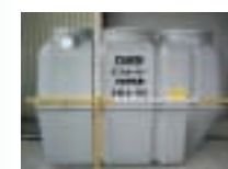
*20 Joint development by four manufacturers achieves high-level processing, compact design, and low price