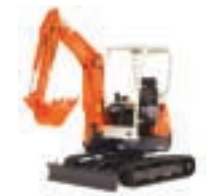
*10 Original anti-theft device is installed for the European market

*9 Small-scale standard-type combine harvester with one top-of-its-class capabilities and functions