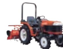
*13 A limited edition commemorative tractor put on the market