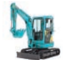
*8 World-class safety features included as standard equipment

*7 The "KT250", equipped with built-in "Double-Speed U Turning" function, offers a compact turning radius