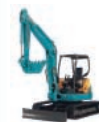
*12 Functions in compliance with European safety standards, viewed as the strictest in the world, standardized domestically into the "CE-Version"