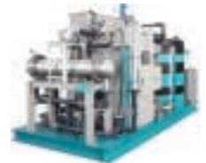
*4 The membrane filtration device for water purification plants

*3 The NS-type fitting with its excellent construction was developed into a series of products